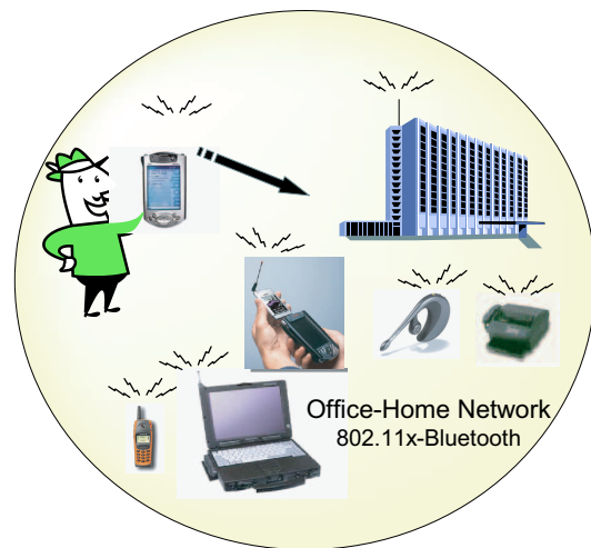
Fig. 1. The multi-service wireless network scenario.

Today's leading wireless technologies such as the IEEE802.11x family and Bluetooth meet some, but not all of the multi-service networking requirements. In this paper we describe a novel system architecture for QoS support in WLAN. While the concepts introduced are fairly general and applicable with minor adaptations to several different technologies, such as Bluetooth, UP-5, Hyperlan, etc. For the sake of simplicity, in this work, we focus our discussion on the IEEE802.11 family WLAN.