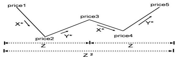
Figure 1: A double-bottom or W-shape stock pattern.

the ORDER BY clause for XML queries is omitted 6 . Here, open() and close() are merely convenient shorthands to recognize open or close tags, e.g. B = \text{open}(\text{'name'}) could be replaced by a condition that B.\text{type} = \text{'open'} AND B.\text{token} = \text{'name'} . Here, we also used the notation I^6 as a shorthand for the repetition, i.e. IIIIII ; likewise (Z : \dots)^2 stands for (Z : \dots)(Z : \dots) . Also observe that, due to their similar definitions, variables E, F, G, H, I and J, are used under both X and Y, and thus we can use the path notation X.E or Y.E to refer to one or the other. When their path notation is missing, the parser disambiguates them by duplicating their predicates for each subpattern that they appear in (see [22]).